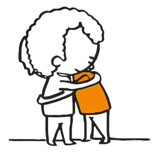
Figure 2 All with You® program image.

and communities and to describe the strategic objectives, indicators and standards that allow measurement of the outcome of their development.